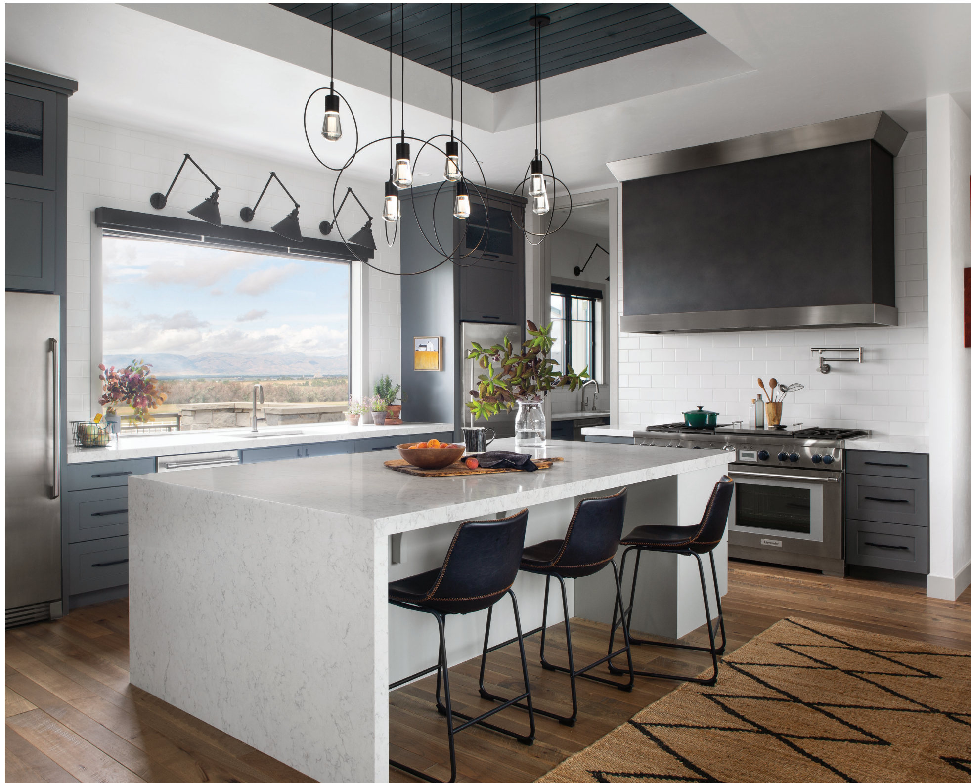
≈ Kitchen Every decision in the kitchen design revolved around the jaw-dropping view of Long's Peak. The Alva Pendants by Tech Lighting were intentionally placed at varying lengths above the kitchen island, and the homeowners decided against upper cabinets. Briarcliff Swing Arm sconce lights from Innovations Lighting guide the eye to the Nano pass-through window that connects to the outdoor porch. The homeowners purchased the leather stools from CB2. »