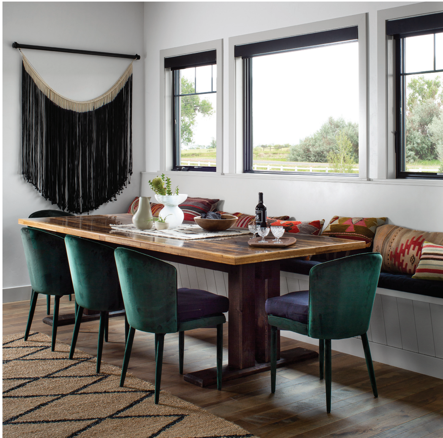
» Dining Area A mix of Turkish rug pillow styles creates a casual vibe in the home. “I don’t like matchy-matchy,” explains Chandler. “I think it evokes a sense of comfort when colors are askew. It looks comfy, so I can get comfy.” Metropolitan forest green velvet dining chairs from tovfurniture.com surround a sizeable custom table. The macramé wall hanging is from Pottery Barn.

“These floors are unbelievable. Remy—a Newfoundland that often visits—runs back and forth, and there’s not a scratch mark in them,” says Chandler. “If there is, I can’t see them.”